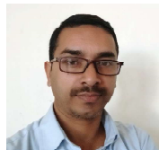
By: M.R. Lahu

India, the world's largest and oldest civilization has been witnessing scores of initiatives by the Modi government since 2014. Many of them were largely indicative of a civilisational revamp that Prime Minister Modi has been unequivocally manoeuvring and with the global acceptance, his government at the centre is upbeat about everything that it believes as a cultural necessity.