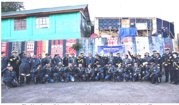
The Naval expedition team posed for a photograph with senior officers.

On Wednesday, the chief of Naval Staff (CNS), Admiral R Hari Kumar, graced the afternoon cultural session as